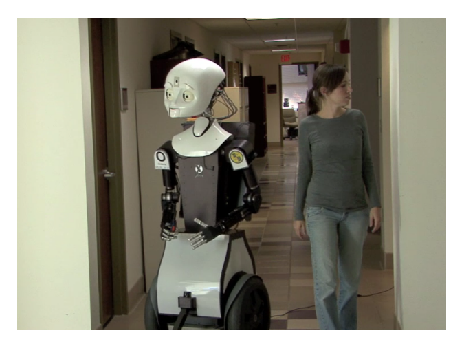
Figure 3. Screen shot from a scenario where the MDS robot and a human teammate are patrolling an area.

Then, at around 4–5 years of age, the model slowly gains the ability to perform the more difficult ToM task. During this task, the marble is replaced by a kitten that crawls between the boxes while child "A" is out of the room. When the child returns, she wants to put a piece of fish under the unoccupied box, and the model is rewarded if it can correctly identify where child A will try to put the fish. To predict child A's behavior, the model first identifies her belief as in the simple ToM task. Then, it uses cognitive simulation to use that belief to predict where the child will put the fish. At first, simulations are likely to fail, but as the model ages, simulations become likely to succeed and the model learns that it is a good way of solving the problem. As with the belief selection mechanism, the model then simultaneously develops the functionality to perform simulation, and learns how and when to do it.